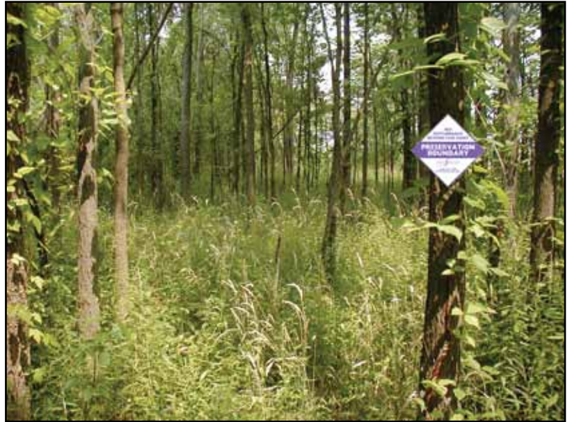
View of CE area with boundary sign attached to tree.